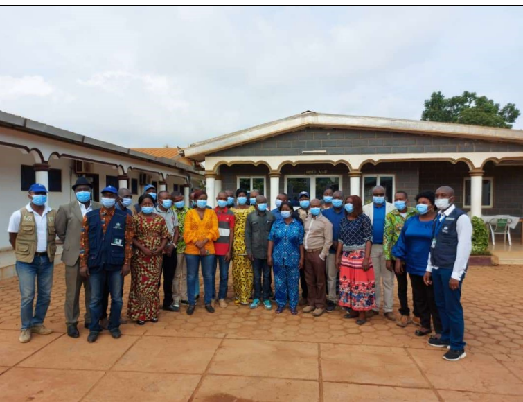
Group photo during the training of Focal Points at Dolisie