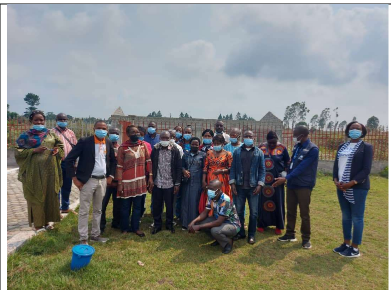
Group Photo during the training of Focal Points at Ignié