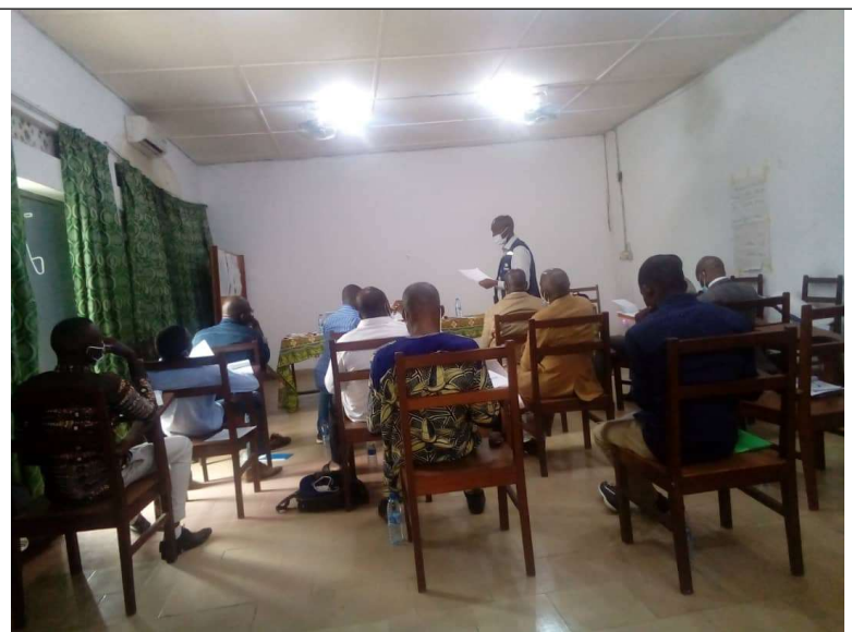
Photo during the training of Focal Points, Owando