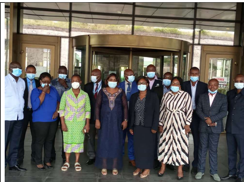
Group Photo during training of CAC members